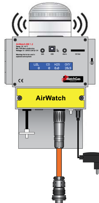
Figure 4: The AirWatch with Beacon Sounder

The optional Datalog saves those gas concentrations in on a SD-card. Together with the optional Wifi-function and the AirWatch Receiver the AirWatch is even able to visualize them in real time in a mesh network, up to 300 meters. You could even let it send mails in case of an event to the responsible persons.