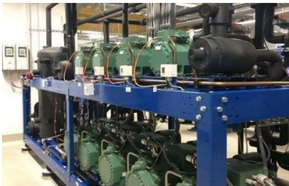
Figure 1: Refrigeration Machine room

This Application note focuses on using the AirWatch for Refrigeration purpose. Therefore, the main focus is on Ammonia and Carbon Dioxide as refrigerant and other gases, which are used as refrigerants, depending on the application itself. Currently there is no sensor for fluorocarbons available for the AirWatch.